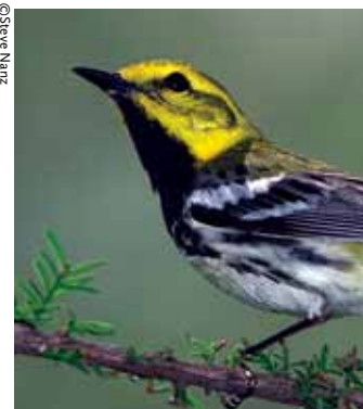
Black-throated Green Warbler

Tuesday, April 26, 6:30-8:30pm (class); Saturday April 30, 8am-noon (trip)