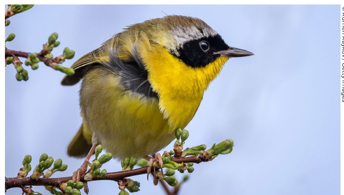
We will continue to dedicate ourselves to making our city safer for birds like the Common Yellowthroat, a frequent collision victim in New York City.

Our assessment ultimately concluded that continued association of our organization with the Audubon name not only raised deeply troubling ethical issues, but also would