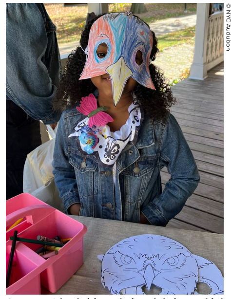
Governors Island visitors designed their own bird masks for our H-OWL-oween weekend festivities.

STAY IN THE KNOW ABOUT PROGRAMS: More details about programs and registration are available at the website above. Sign up for the eGret eNewsletter at nycaudubon.org/egret and follow us on Instagram, Facebook, and Twitter (@nycaudubon) to ensure you know about events as they are announced.