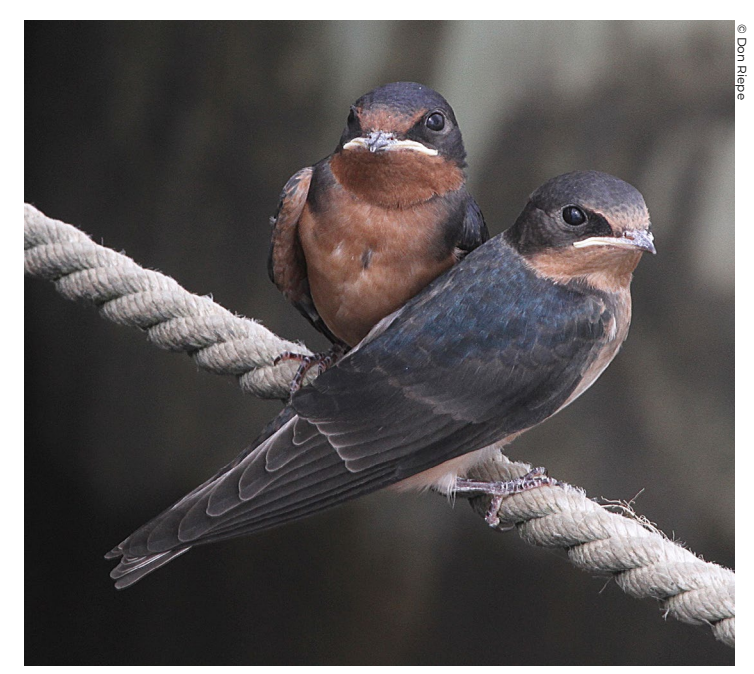
Barn Swallows often nest in areas with human development.

Other swallows nest on my dock: Tree Swallows have nested on a pole in a bluebird box, with Purple Martins in a large multiple-dwelling martin house above them. These species help the Barn Swallows in putting a dent in the number of mosquitoes and deer flies that occasionally plague us in summer. Barn Swallows are easily distinguishable from other swallows by their deeply forked tail, rust-colored throat, and pale orange breast. It's a delight to have them as neighbors.